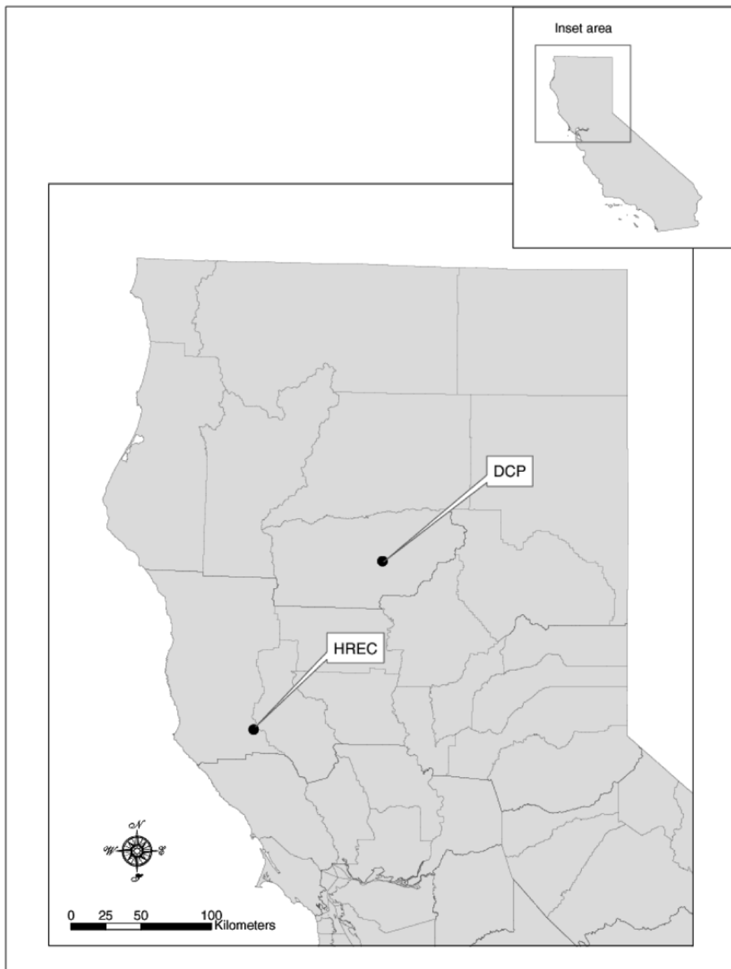
FIGURE 1. Map of northern California (USA) showing locations of the Hopland Research and Extension Center (HREC) and the Dye Creek Preserve (DCP).