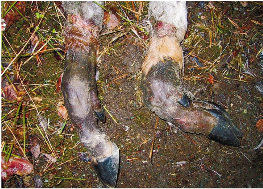
FIGURE 1. Moose calf (no. 3) showing bilateral gangrene of the hind limbs extending up to the distal third of the metatarsus. There is discoloration and loss of hair in the necrotic skin, and separation of the skin between necrotic and viable areas. Rims of unshed brown calf haircoat are seen distal to the separation zone.