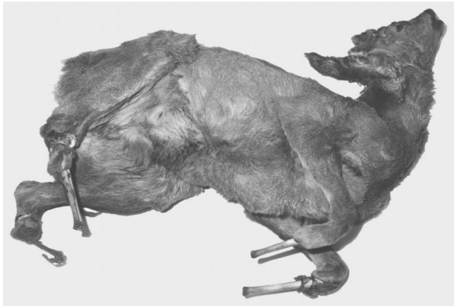
FIGURE 4. Roe deer (no. 11) showing loss of all digits and the naked metacarpal/metatarsal bone shafts with disintegrated skin and muscles advancing up to the proximal third (the left metatarsal bone had fractured during transportation and is not seen on this photograph). Wear, erosion, and discoloration are seen on the bone ends.

is difficult to confirm, especially in free-living animals that are not normally seen until lesions are in an advanced state, long after the toxic insult has ceased. The differential diagnoses would include conditions such as trauma, accidental ligation of the appendages, bacterial infections, and the effects of cold. In nine of the reported cases, there were multifocal lesions, indicating systemic vasoconstriction that was not consistent with trauma or ligation. There also were no indications of a primary bacterial infection. Both roe deer and especially moose are well adapted to the cold climate found in northern latitudes, making frostbite an unlikely cause. However, it should be kept in mind that low temperatures during late autumn and winter may have exacerbated the circulatory disturbances and the loss of extremities in these animals. Low environmental temperatures have been suspected to exacerbate clinical signs of gangrenous ergotism in domestic ruminants (Woods et al., 1966).