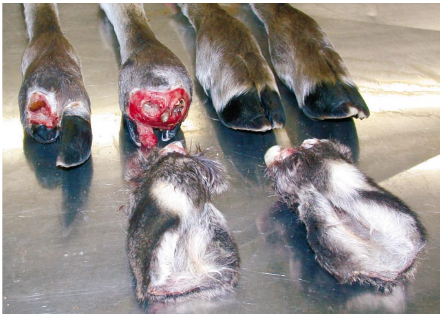
FIGURE 2. Moose calf (no. 1) showing unilateral (left) and bilateral loss of the distal and medial phalanx of the two hind limbs, as well as both ear tips. The forelimbs are normal. Swelling and exposure of the medullary cavity of the proximal phalanges are seen in the limb with bilateral lesions.