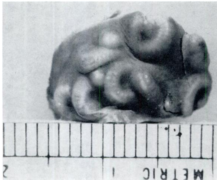
FIGURE 1. Portion of ferret-badger liver with encysted larvae of Armillifer sp.