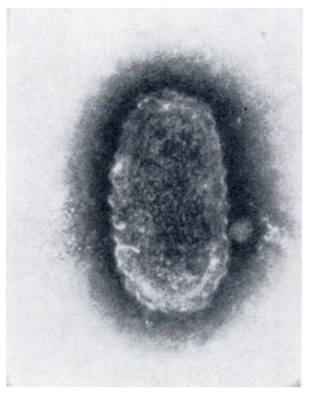
FIGURE 3. C form showing capsule with serrated margins enclosing inner body. Phosphotungstic acid stain, pH 4.3. X 121,400.

Downloaded From: https://complete.bioone.org/journals/Journal-of-Wildlife-Diseases on 19 Apr 2024 Terms of Use: https://complete.bioone.org/terms-of-use