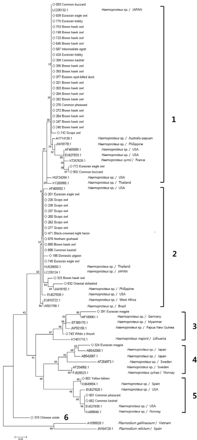
FIGURE 3. Phylogenetic analysis of genus Haemoproteus in wild birds of the Republic of Korea. Sequences identified in this study (47 individuals) are marked with diamonds. Previously reported sequences of Haemoproteus spp. ( n=28 ) from wild birds were included and two Plasmodium species (AY099029.1 and JN164729.1) were used as an outgroup. Neighbor-joining phylogenetic analysis was performed by MEGA v7. Numbers on branches indicate bootstrap values based on 1,000 replicates.