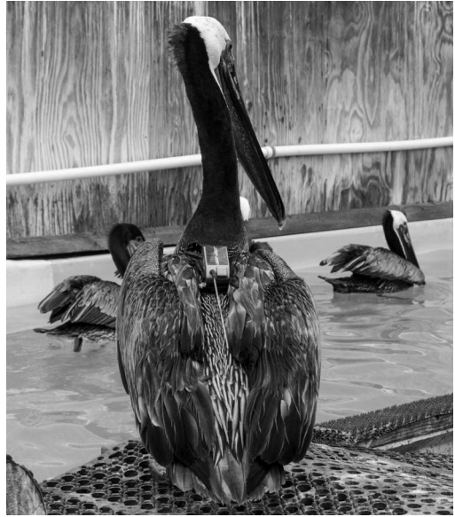
FIGURE 2. Oiled, rehabilitated, and tagged California Brown Pelicans ( Pelecanus occidentalis californicus ) were fitted with GPS satellite Platform Terminal Transmitters attached as backpacks with Teflon ribbon. The units weighed 65 g and were custom designed to have a sloping front edge to reduce drag during diving.

The online wildlife tracking database Movebank ( www.movebank.org ) was used to collect data from the PTTs. Initially, the duty cycle of the