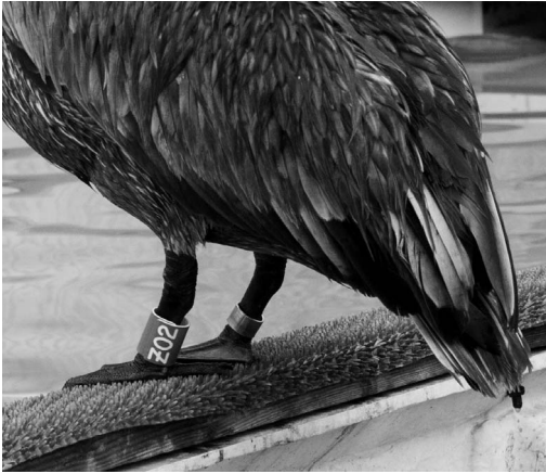
FIGURE 1. Oiled, rehabilitated, and tagged California Brown Pelicans ( Pelecanus occidentalis californicus ) released with GPS satellite Platform Terminal Transmitters were fitted with a large, plastic, green, uniquely numbered band on one leg and a metal federal band on the contralateral leg. Oiled birds had bands with the prefix “Z,” while tagged control pelicans had similar bands that were blue with the prefix “N.”

absence of compounding factors, such as previous illness, severe pododermatitis, or healed fractures (oiled, rehabilitated, and tagged birds [ORT]). Once pelicans were deemed healthy enough for release, they were instrumented and released at the recently decontaminated Gaviota Beach within 1 wk. We affixed 65-g solar-powered GPS satellite Platform Terminal Transmitters (PTTs; Geotrak Inc., Apex, North Carolina, USA) with a Teflon ribbon harness as described in Lamb et al. (2016) and shown in Figure 2. Birds were observed in aviaries for approximately 3 h after PTT (tag) attachment, to ensure that they were able to walk and swim (Lamb et al. 2016). All tagged birds were released the day after transmitter attachment, on 12 and 27 June 2015.