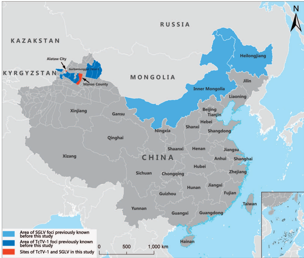
FIGURE 1. Map showing sites (in red) at which great gerbils ( Rhombomys opimus ) were caught and sampled for viruses during 2019–2021, providing new confirmed locations for Tacheng tick virus 1 (TcTV-1) and Songling virus (SGLV). Areas in which SGLV and TcTV-1 have previously been detected in China are also shown on the map, in pale blue and dark blue, respectively.

During 2019–21, 276 great gerbils were collected at 16 sampling sites in Alataw City (45°19'N, 82°56'E) and Manas County (43°28'N, 85°34'E), Gurbantünggüt Desert, XUAR (Fig. 1). The gerbils were captured using 390 Sherman live traps (30 cm × 15 cm × 15-cm wire mesh; Alataw City) baited with walnut, cucumber, or tomato. Traps were checked twice daily and rebaited whenever necessary; trap success rate was from 0.5% to approximately 3% (Kamranrashani et al. 2013; Zhao et al. 2020; Ji et al. 2021). To prevent the spread of highly pathogenic infections, the rodents were trapped and handled following biosafety guidelines (Mills et al. 1995). All wild rodents were morphologically identified by an experienced zoologist. The rodents in