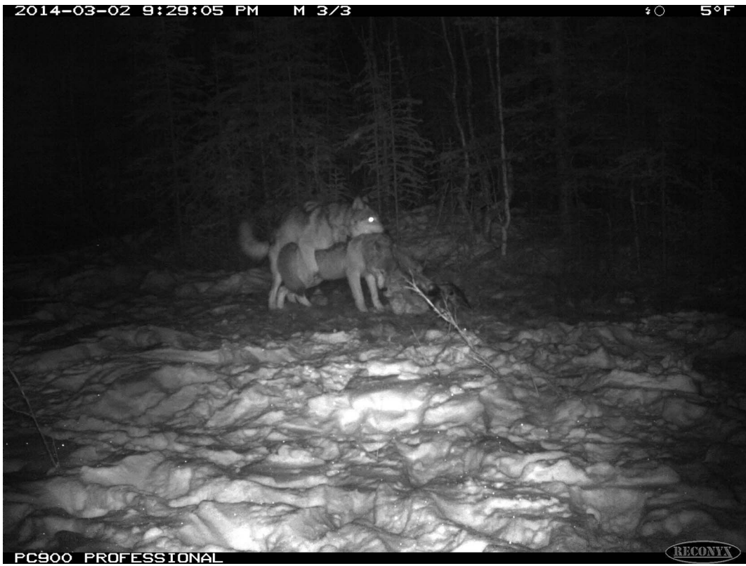
FIGURE 2. Suspected true hermaphroditic gray wolf ( Canis lupus ) 1306 mounting another wolf on 2 March 2014 in Denali National Park and Preserve, Alaska, USA.

incompletely extending over this organ. There was no evidence of a scrotum. Internally, there was a bicornate uterus with an enlarged uterine body (Fig. 1E, F), lacking a true cervix, instead widening into a vagina ending blindly past the base of the urinary bladder and not appearing to connect with the vulva (Fig. 1G, H). The urethra extended into the external genitalia. A small bulge corresponded to the typical location of a prostate in the pelvic inlet.